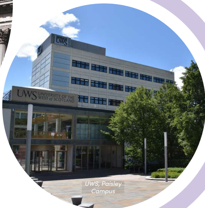
UWS, Paisley Campus