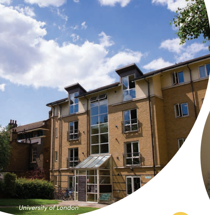
University of London